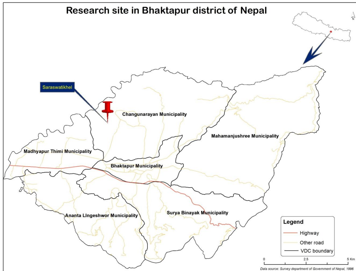
Figure 1. Map and location of the research site

1982), bulk density (BD) dry combustion method (Blake & Hartge, 1986), soil organic matter (SOM) dry combustion method (Nelson & Sommere, 1982), total nitrogen (TN) by Kjeldahl method (Bremner & Mulvaney, 1982), available phosphorus (AP) by modified Olsen's method (Olsen & Sommers, 1982), exchangeable potassium (EK) by ammonium acetate extraction followed by AAS method and cation exchange capacity (CEC) by ammonia acetate extraction method (Rhoades, 1982).