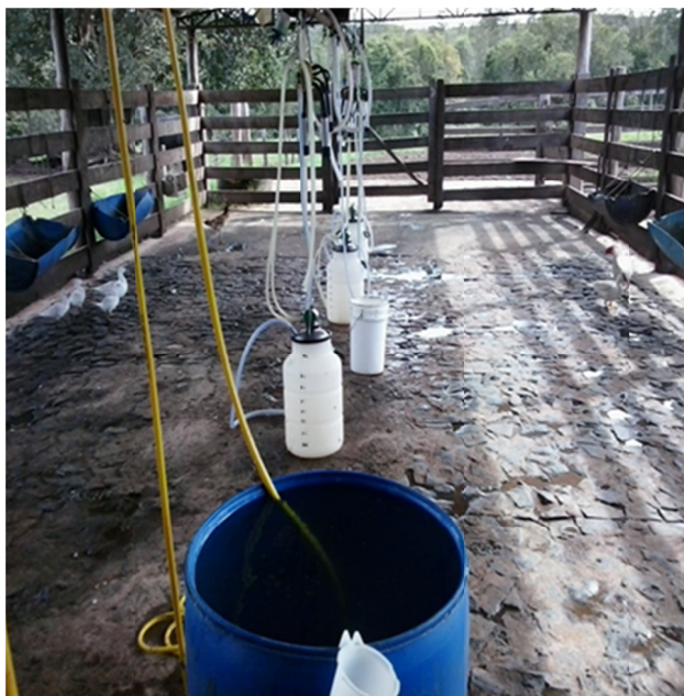
Figure 1. Internal view of the milking parlor on a rural property (Itarumã, Goiás, Brazil)

Table 1 shows the daily variations in water consumption and waste generation in the second stage of this work. The variation in water consumption and waste generation in milk production were the result of numerous factors, such as the number of milked animals, the techniques, and equipment used in the production stages, among others.