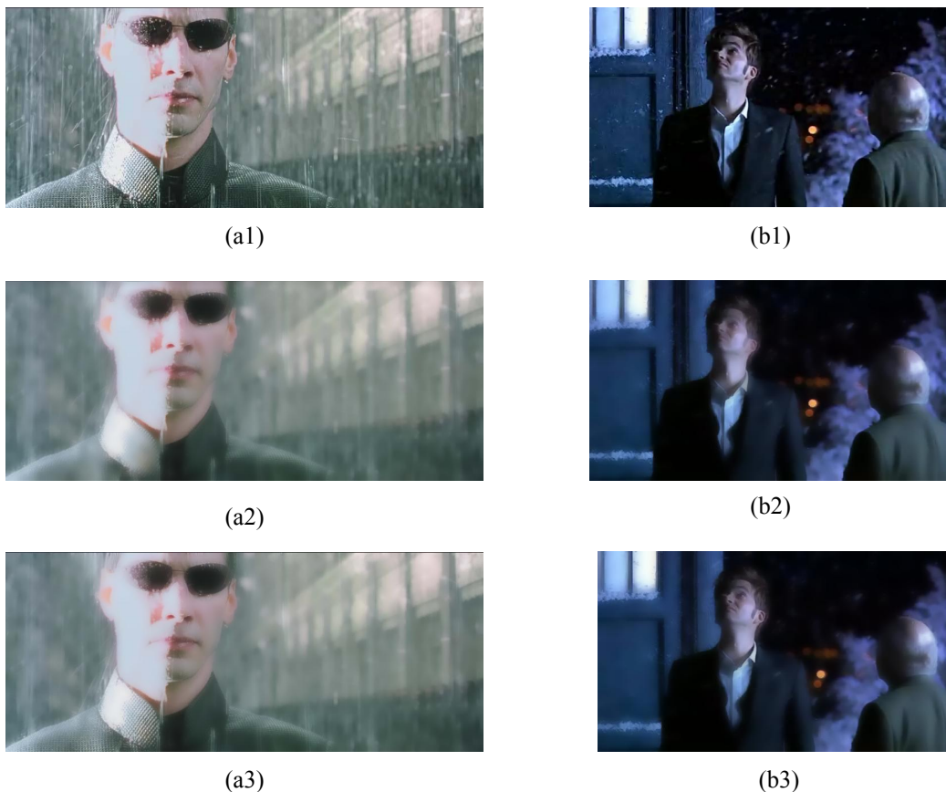
Figure 2. The removal results of rain and snow

(a1) A rain-affected image; (a2) The removal result using guidance image; (a3) The removal result using the refined guidance image