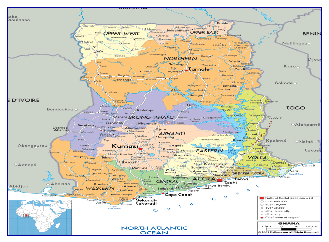
Figure 1. Administrative map of Ghana (Ghana Statistical Service, 2011)

Council for Agricultural Research and Development (CORAF/WECARD) and implemented in Ghana by CSIR-SARI (Council for Scientific and Industrial Research). A map of the study area is shown in Figure 1 below.