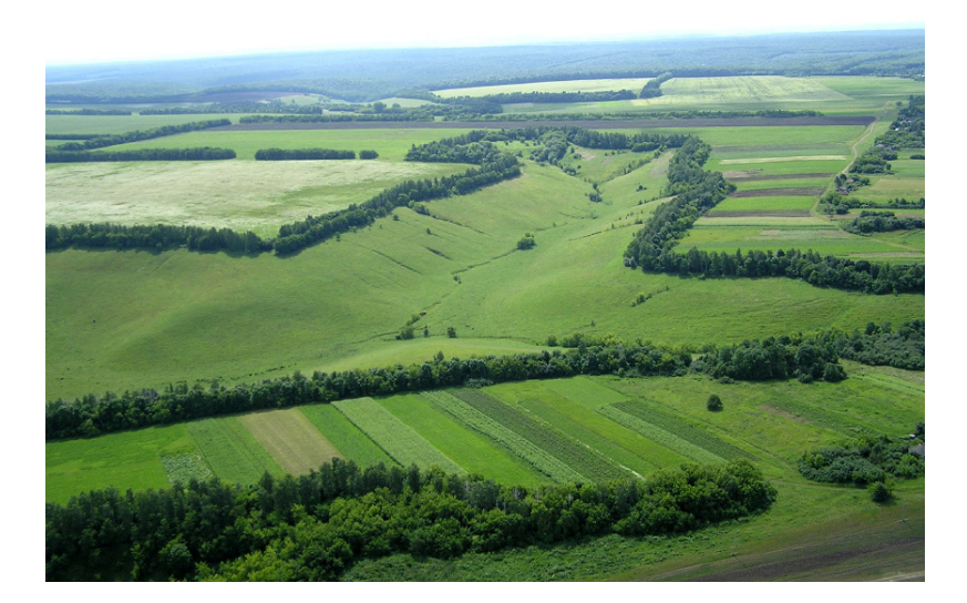
Figure 2. After development of landscape agricultural systems (2008)

The landscape agricultural system's elements are an organization of land-use, differentiated location of crop rotation of different soil protection direction, soil protection technologies of crops and systems of machines, forest improving, meadow-improving, hydraulic and other activities. The key moment and the basis for the whole complex of soil protection activities become erosion-preventive territory organization, as it includes territory typification and marking of agrolandscape stripes by homogeneous agriculture ecological conditions, erosion rates, angle slope and pattern of use. Allocated agrolandscape strips characterize 4 modules of landscape agricultural systems: intensive (intensive technologies, intensive crop rotations with saturation of row crops, intensive sorts, etc.), soil protective (excluding the use of row crops), biological (with the saturation of perennial grasses from 50 to 100%) and remediation (solid grassing, continuous afforestation, flattening of the ravine, etc.).