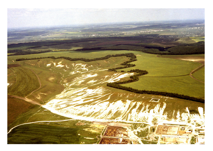
Figure 1. Before development of landscape agricultural systems (1979)

The great contribution in working out theoretical bases of landscape agriculture was brought by the academician of Russian Academy of Agricultural Sciences O.G. Kotlyarova, under her guidance a large-scale development of landscape agricultural systems was carried out in Krasnogvardeiskiy district of Belgorod region (Figures 1 and 2).