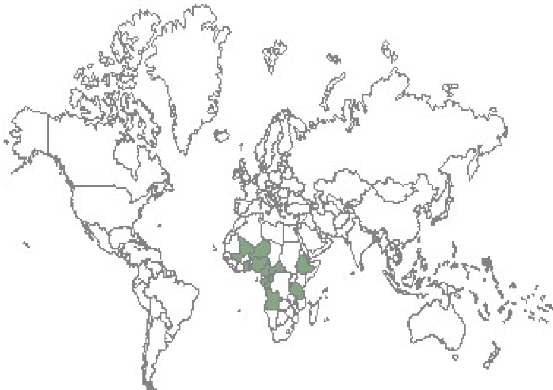
Figure 1. The centre of diversity for African yam bean

AYB tolerates wide geographical, climatic and edaphic ecologies. The stretch of the environment where it thrives lie within the latitudes of 15^\circ North to 15^\circ South and the longitudes of 15^\circ West to 40^\circ East of Africa (Adewale et al., 2008). There is no record of the origin of the crop in any other continent except Africa (Potter & Doyle, 1992; Potter & Doyle, 1994). Hence, the above geographical catchments could be referred to as the centre of diversity of AYB (Figure 1). This confirms the common claim that the crop is a tropical African legume.