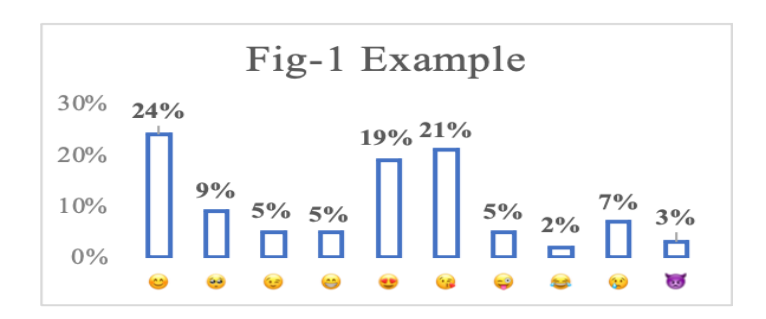
Figure-1 depicts the bigger piler for smiley emoji and smaller pilar for laughter emoji expressed on screen. After smiley, the most frequent emojis expressed to the post were loving and kiss. The overall analysis of emojis in figure-1 is showing the supportive screen-interaction of viewers to the specific post understudy at the official Facebook page of the organization.