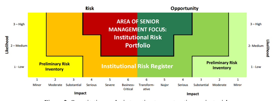
Figure 2. Quantitative analysis to estimate construction projects risk

By the end of all these steps, risks are prioritized in details and quantitatively and the prioritized set of their related reactions are also determined. The next steps of construction project life cycle are allocated to control and management with respect to the obtained results. In case of identifying new risky cases or changing project conditions in each step of life cycle, the performed works will be modified. Then, returning to identification and re-implementation, risk management process will be updated. Figure 2 shows the general quantitative analysis to estimate construction projects risk.