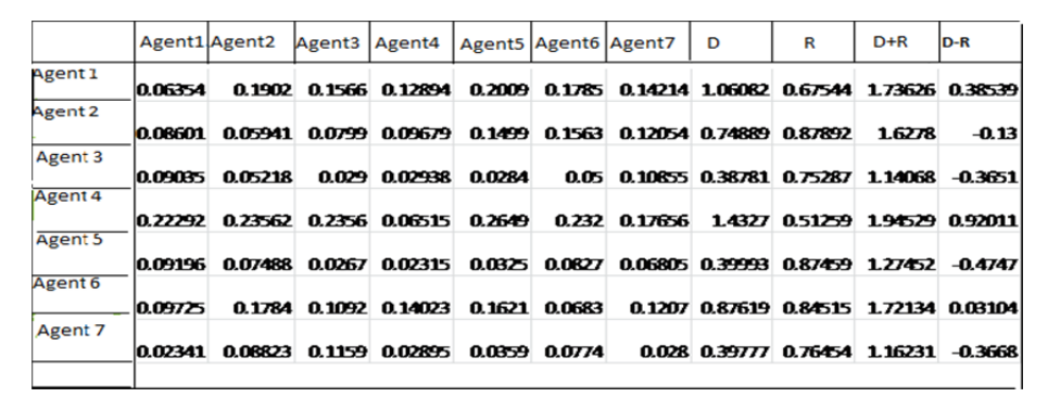
Figure 5. Matrix of total relations (medium)