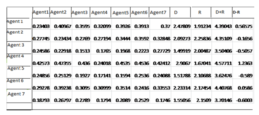
Figure 6. Matrix of total relations (high)