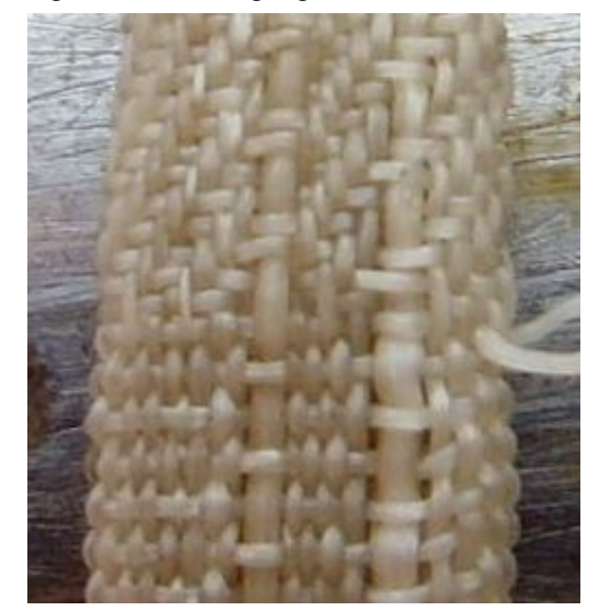
Figure 2. The first part is the 2/2 twill part and the second part is the 1/1 plain weave (two longitude yarns are thick)

Figure 1. Machining Figure of 2/2 Twill Weave