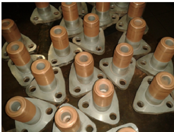
Figure 3. Contact part after an application of copper sublayer by detonation method

An application of coating was carried out in the following sequence: purging of nozzle of detonation equipment by air; filling of nozzle of detonation equipment with an explosive mixture of acetylene and oxygen; introduction of a portion of deposited powdered material (copper powder with dispersion of 40-60 micron) into nozzle; initiation of gas mixture by spark discharge; deposition of PM on a surface of aluminum contact; purge nozzle of an equipment after a projection by air (nitrogen); rotation of a workpiece on a handling device.