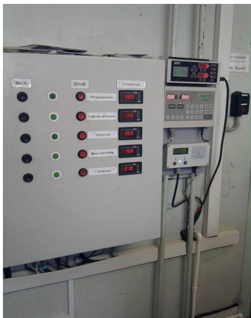
Figure 5. Equipment for nanostructured silver-diamond coatings' deposition

An equipment, which is developed on a basis of programmable controller with a built-in microprocessor, allows to automatically control electrolysis using specified program with a feature that allow to freely select type of current (direct, alternating, impulse, asymmetric, etc.), a selection of value and duration of pulses direct and reverse currents, a pause between them, positive or negative offset of permanent part of current, provision of a stabilization of current and voltage (Figure 5).