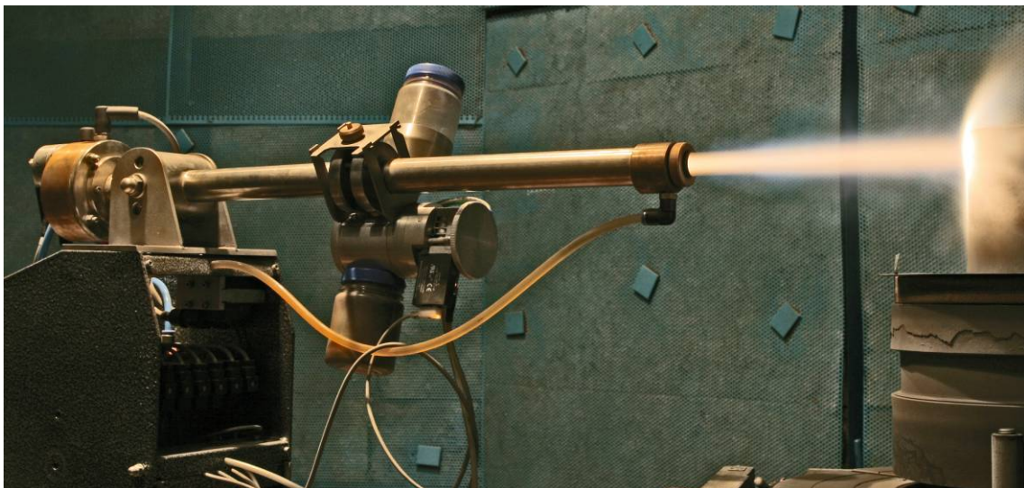
Figure 2. Equipment for detonation deposition

In order to confirm adequacy of theoretical assumptions, a formation of a copper coating by detonation method on a surface of aluminum contact element of "Tul'pan [Tulip]" type are conducted. Before an application of copper coating, the surface was subjected to abrasive-jet treatment in order to clean it and to provide conditions for adhesion with a surface of aluminum contact. For an application of detonation coating detonation deposition equipment (Figure 2, a) with a control software was used, which provides specified uniformity of coating during an application of several of consecutive layers with spiral application pattern.