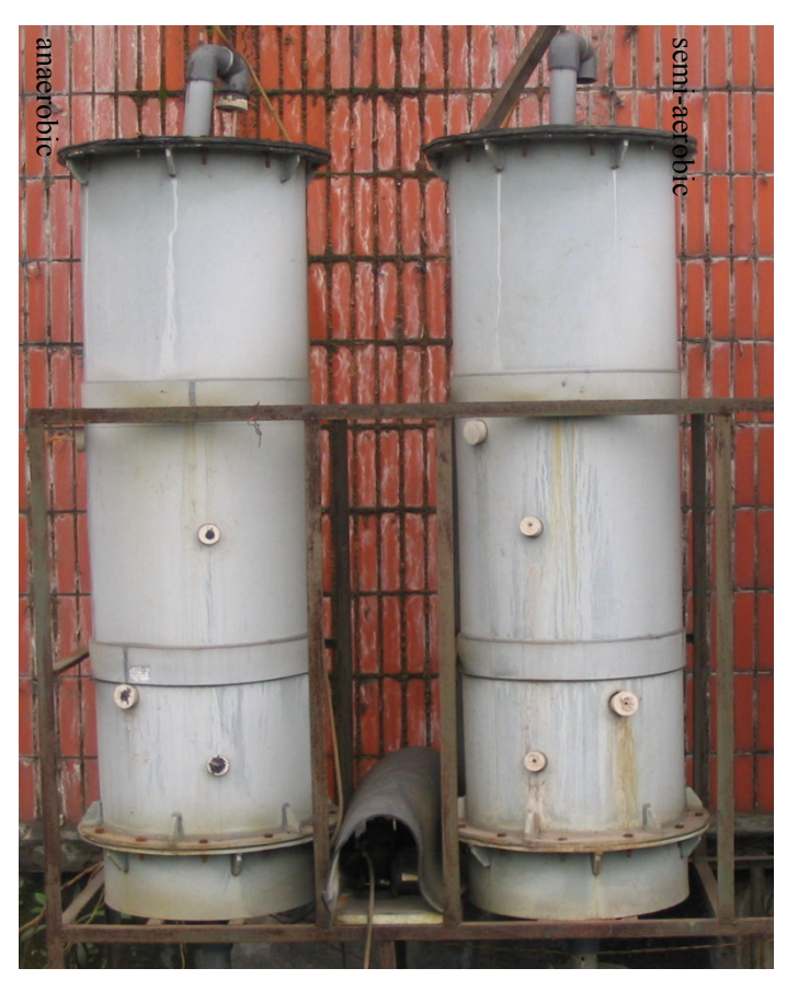
Figure 1. The refuse column of semi-aerobic landfill and anaerobic