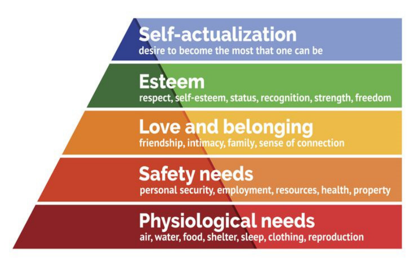
Figure 2. Abraham Maslow's hierarchy of needs

Concerning the above-stated question, an individual must have a proper understanding of the issue of human behavior such as Abraham Maslow's hierarchy of needs model presented in below figure 2 (Education Library, 2021). Additionally, it is unlikely that most of the intended beneficiaries would have achieved the top-most level of Maslow's pyramid i.e. self-actualization. However, there is a presupposition that the beneficiaries had attained level 1, thereby depicting basic safety needs. This includes assuring basic security and protection. However, the majority of the intended beneficiaries would not visualize the larger picture. This includes the level of self-actualization of a positive or negative outcome later on in a lifetime (Education Library, 2021).