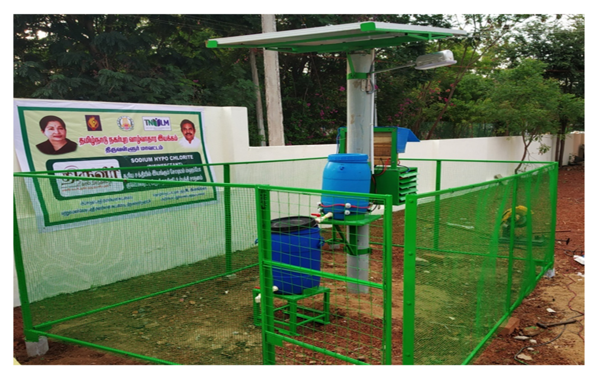
Figure 7. 25 Liters production unit installed in a locality at Thiruvallur, a neighboring village to Kuthambakkam