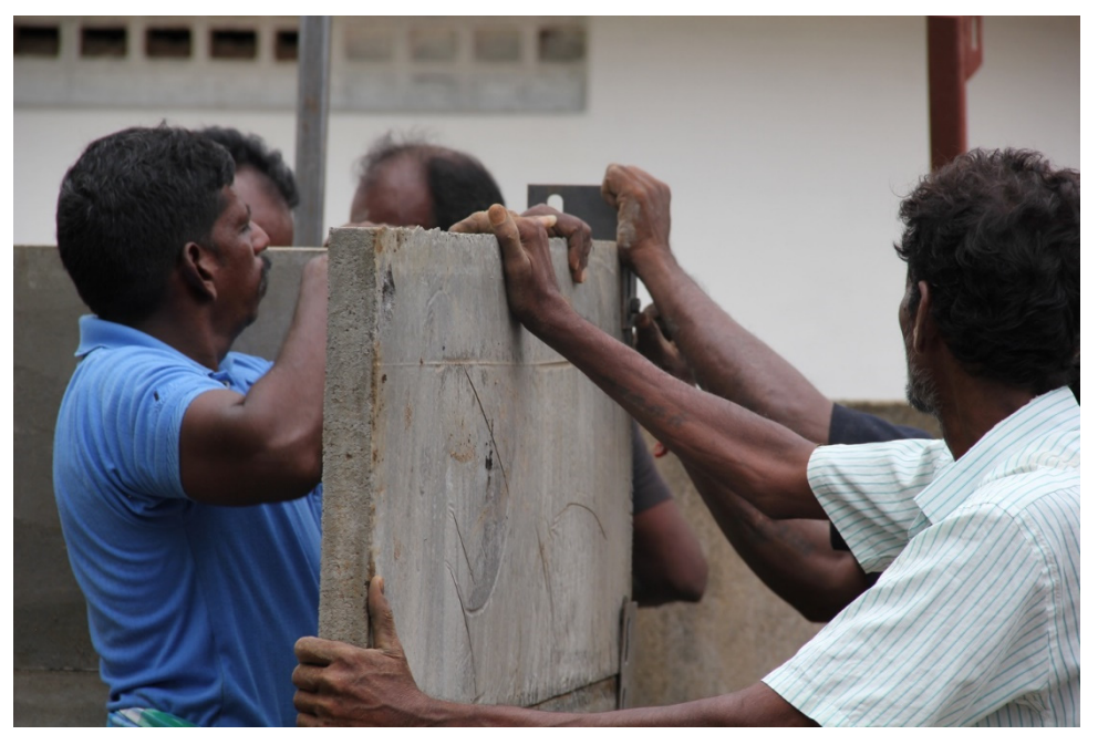
Figure 2. Concrete slab sanitation under construction

Decision makers are aware of the environmental issues caused by use of standard concrete. But the decision was that the immediate improvement to housing was of greater value to the long-term vision of a sustainable village than the impact of continued use of concrete. When an alternative option made from sustainable materials becomes accessible, they will convert to using such material to build homes and toilets. This is the trade-off between addressing poverty in the immediate, and long-term environmental sustainability. The construction methods are already effective and affordable, and with sustainable material use, it is a complete and outstanding model of sustainable housing.