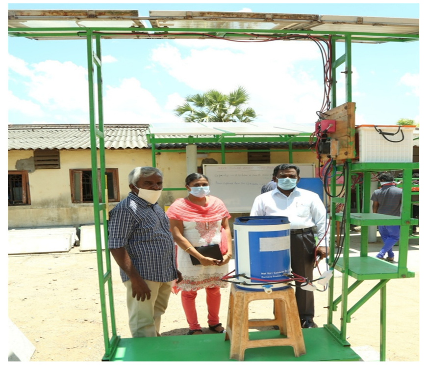
Figure 5. 25 liters of 8000 NaOCl ppm solution per day production unit