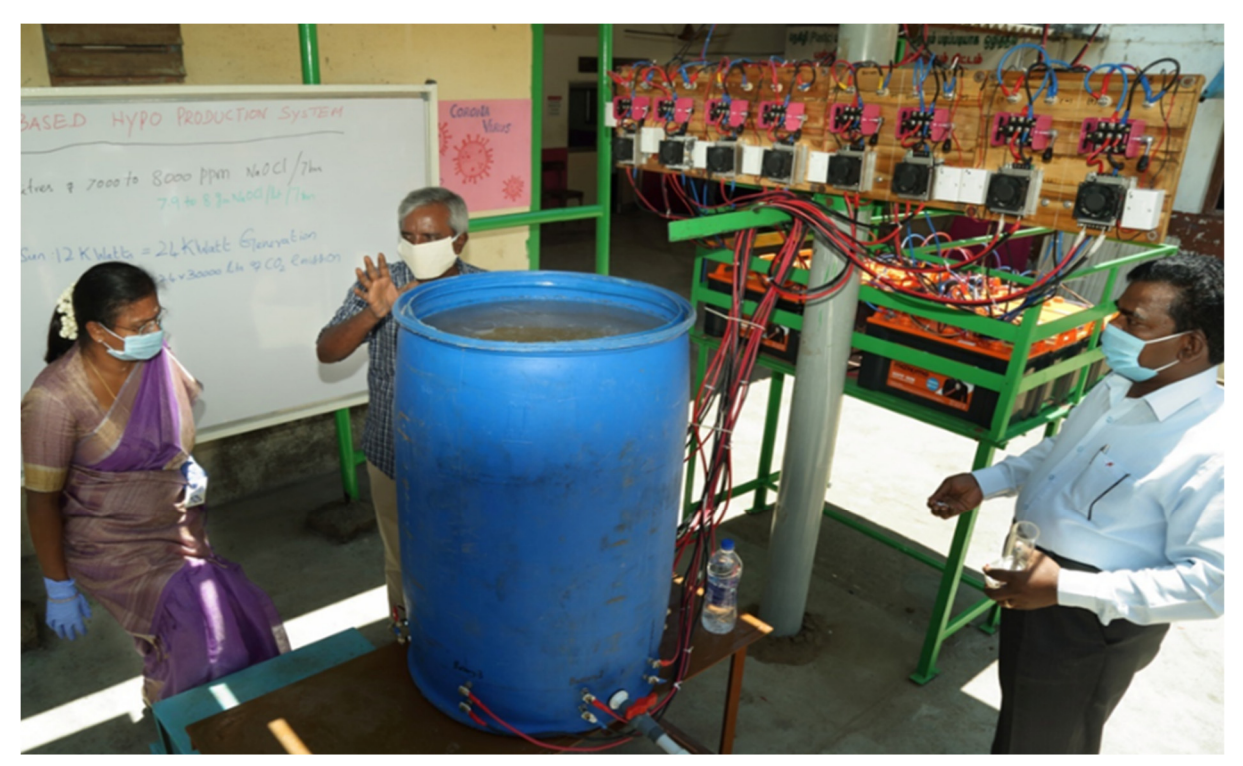
Figure 6. 200 Liters production unit