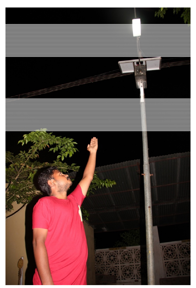
Figure 3. Solar light installed at Muslim Girl's School in Tamil Nadu

injury is significant. Young women seeking to achieve economic independence are at most risk. It is no coincidence, and no political stunt, that one of the first solar light construction projects was undertaken at a Muslim girls school to resolve poor lighting on the main entranceway.