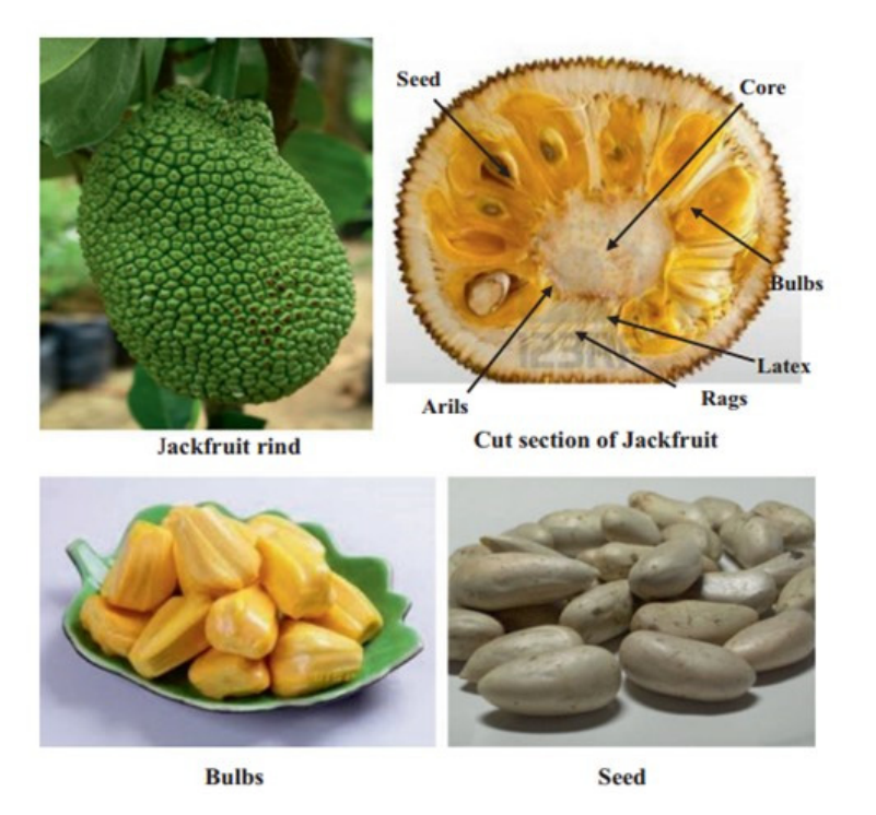
Figure 1. Parts of jackfruit (Swami, Ratnagiri, & Kalse, 2018)

Jackfruit has three main parts (Ranasinghe Maduwanthi, & Maduwanthi, 2019): the fruit axis, the perianth and the bulbs. The axis contains the core, latex and the arils (Figure 1). Jackfruit has lactiferous cells which are responsible for production of latex (Ranasinghe & Maduwanthi, 2019) which is sap that sticky in nature. The perianth contains the rind and the rags, the bulbs contain the edible part and the seeds (Figure 1). The inedible parts of jackfruit include prickly rind, non-edible perianth and a central core (Xu et al., 2018). All these inedible jackfruit parts are potential raw materials for bioenergy and biochar production.