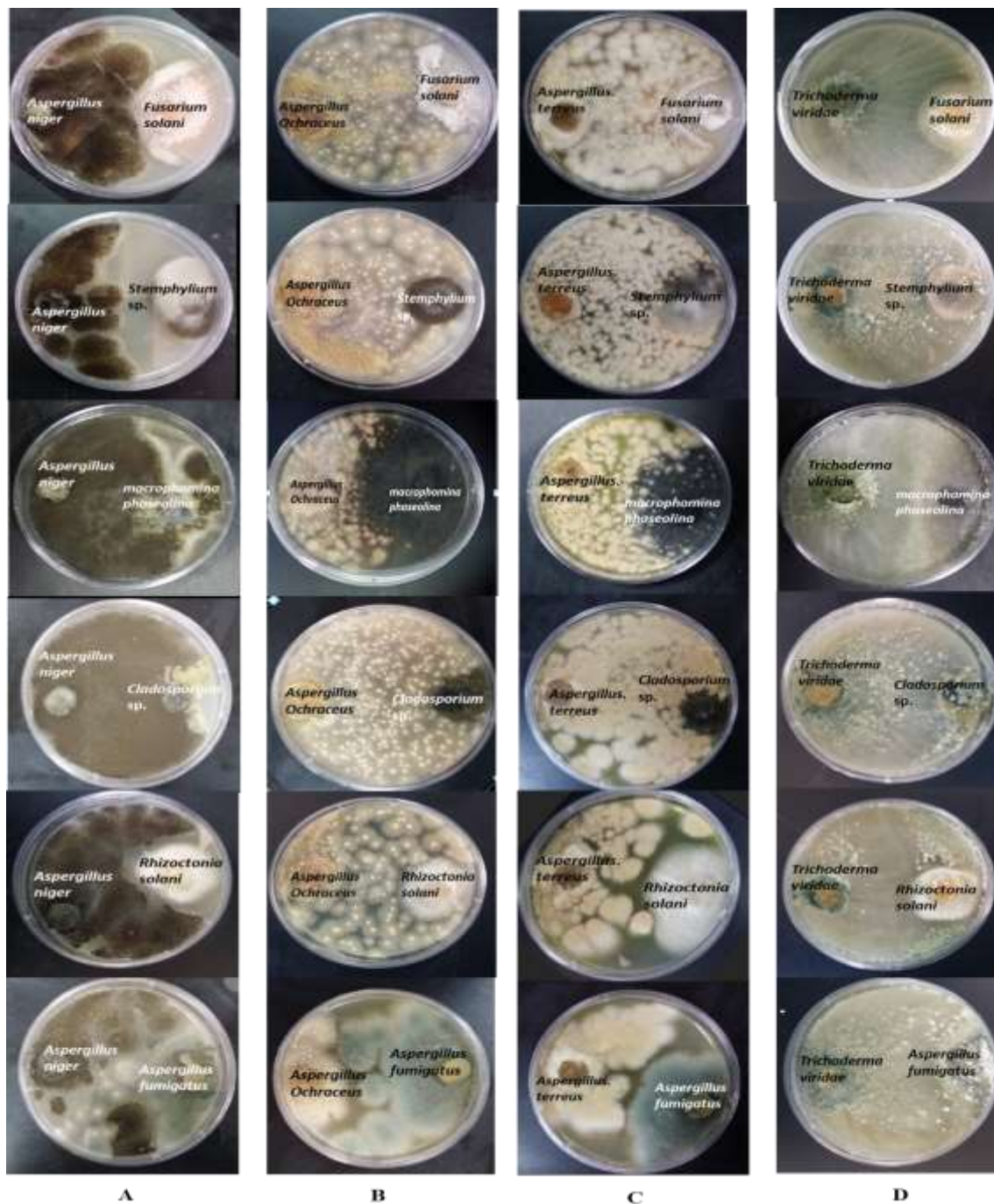
Figure 2. Antagonistic activity of endophytes Aspergillus niger (A), Aspergillus ochraceus (B), Aspergillus terreus (C) and Trichoderma viride (D) against some phytopathogenic fungi in vitro by dual culture assay