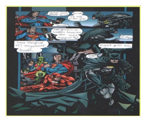
Figure 3. Aysenur's gap-filling comic book

There are two activities at this stage. First, students are asked to perform an activity called "Pictures and Writings". Aysenur, one of the key participant students said "I used these expressions, because the pictures, movements, behaviors, posture styles tell me that I should write them. I wrote these statements because the Justice League was always created to find justice." (Aysenur, activity file, p. 14) Ayşenur's text is shown in Figure 3.