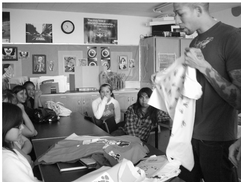
Figure 1. The design high school Friday event I (March 27, 2009)