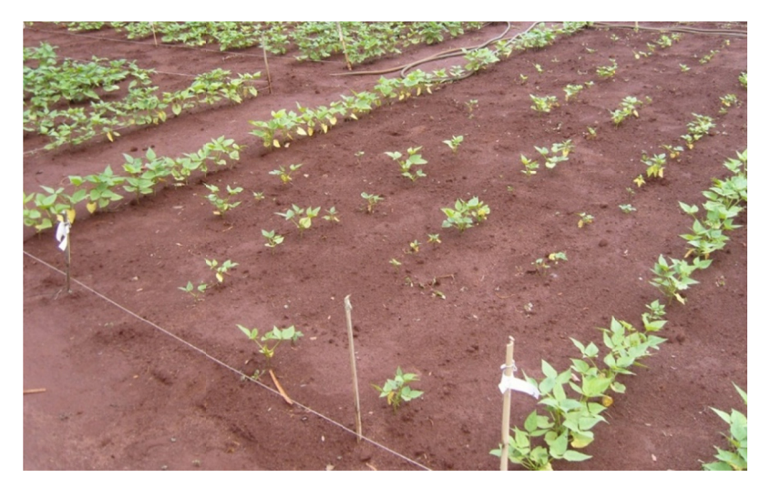
Figure 2. Influence of Se application (5000 g/ha of sodium selenate) on the germination and initial plant growth of P. vulgaris L.