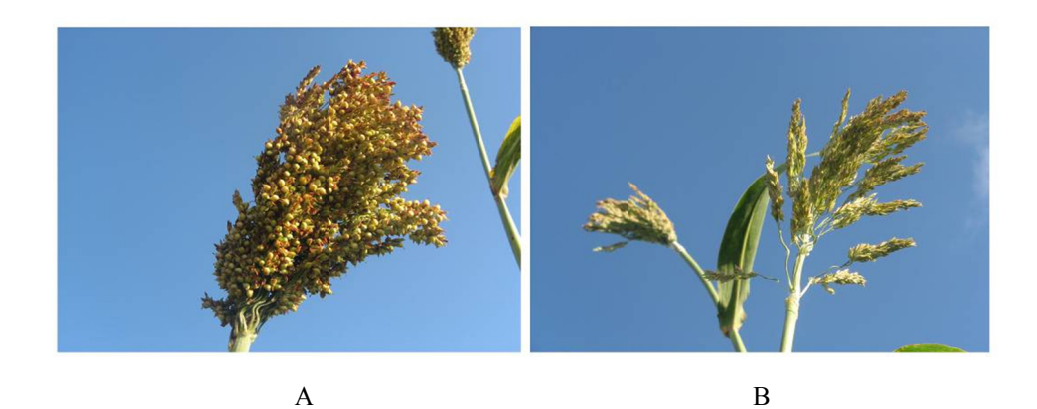
Figure 2. An early-maturity mutant was obtained after carbon ion irradiation in sweet sorghum. A is early-maturity mutant, B is wide-type plant

Field trials showed that the seedling growth of KFJT-1 was inhibited compared to KFJT-CK because of carbon ion beam irradiation, which similar to previous studies (Bae et al., 2004; Zhou et al., 2006). The elongation stage is key stage for sweet sorghum (Li et al., 2004), leading to obvious rise trend for the plant height of KFJT-1 and KFJT-CK during this stage. The average height of growth per day was 6.2 cm in KFJT-CK, faster than that of KFJT-1, the corresponding value being 5.8 cm (Dong & Li, 2014), while the flowering time of KFJT-1 is earlier than that of KFJT-CK, which KFJT-1 had been at flowering stage when KFJT-CK was still at booting stage (Dong et al., 2012). In terms of pollen, the total number and viability of pollens of KFJT-1 were more than that of KFJT-CK. Further analysis showed that the meiosis of KFJT-CK was being at the stage of the first meiotic division when the meiosis of pollen mother cells was mostly turned into the second meiotic division for KFJT-1 (Liu et al., 2012).