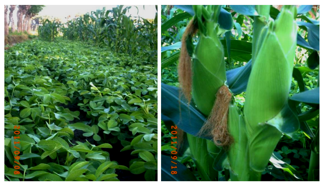
Figure 3. The growth example of generation local peanut on second year research (cleansing)