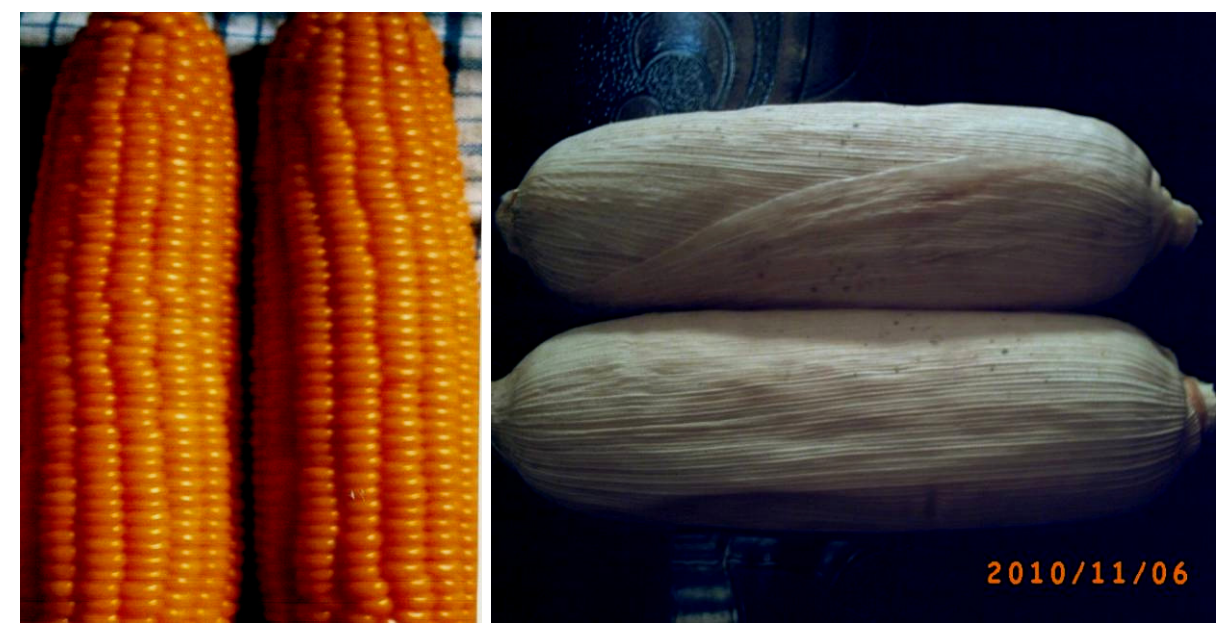
Figure 6. Superior sweet yellow corn as a result of multigamma radiation (local corn)

The results of observation and measuring of physical and chemical characteristics show that local creep peanut and local erect peanut from East Sumba that developed with multigamma radiation on multiculture system, tolerant to abiotik conditions like as dry conditions, high salt, high calcium, and poor of micro-macro elements, and tolerant to biotic conditions like as germ. Based on data in Table 1 and Table 2, can be proposed that seeds of local peanut from East Sumba as a result of multigamma radiation have grow power is higher than initial local peanut and growth is more quickly than initial local peanut, flowered time is quickly and harvest time is more quickly than initial peanut. Economizing time obtained as large as 41.67% up to 46.70% for superior creep peanut and 2.17% up to 12.04% for superior erect peanut.