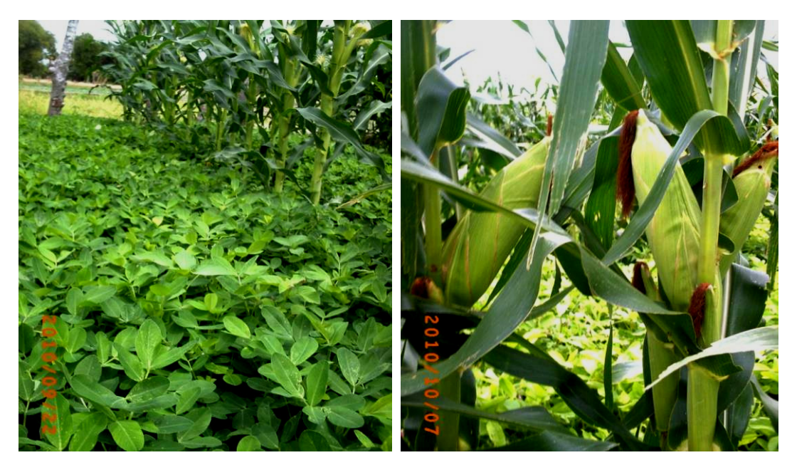
Figure 2. The growth example of local creep peanut as a result of multigamma radiation and superior sweet yellow corn (multiculture) on flowered period until age resemble to young harvest, which fertile grow at garden with high calcium and high salt