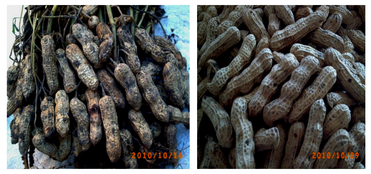
Figure 4a. Generation erect peanut