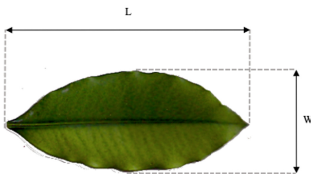
Figure 1. Representation of the length (L) along the midrib and the maximum width (W) of leaves of Garcinia brasiliensis Mart

For the measurement of L, the portion that went from the insertion of the petiole to the apex of the leaf was considered, W was measured through the largest width of the leaf blade (Figure 1), both measurements were made with the aid of a ruler graduated in mm. LW was obtained after the multiplication of the values of L and W. Subsequently, OLA values were determined by image processing obtained from the scanning of sheets by HP Deskjet F4280® scanner, saved in TIFF (Tag Image File Format) with 75 dpi and analyzed through ImageJ® software (Schindelin, Rueden, Hiner, & Eliceiri, 2015).