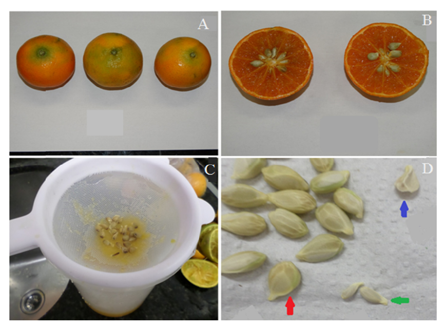
Figure 1. A: Fruits of the Page variety; B: fruits cut to remove the seeds; C: Seeds were washed with neutral detergent; D: Seeds classified as having normal size, indicated by the red arrow, underdeveloped, indicated by the blue arrow, and small, indicated by the green arrow

Seeds were selected with priority that were 3 to 6 times smaller than the seeds containing diploid embryos, since these have strong potential to produce triploid individuals (Aleza, Juárez, Cuenca, Ollitrault, & Navarro, 2010b).