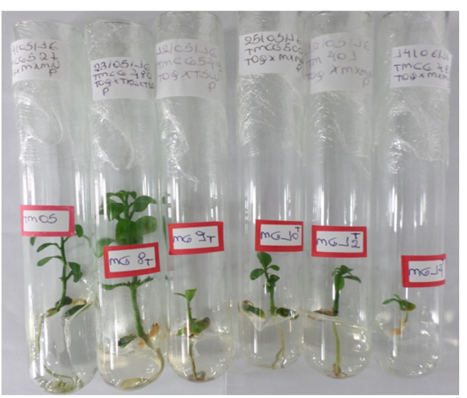
Figure 4. Triploid plants from in vitro culture of seeds from controlled crosses between the parents: 'Ortanique' tangor [ Citrus reticulata Blanco × C. sinensis (L.) Osbeck] × 'Montenegrina' mandarin ( C. deliciosa Ten.); 'Ortanique' mandarin × 'Swatow' mandarin ( C. reticulata )

Note. <sup>1</sup>Tangor 'Ortanique' [ Citrus reticulata Blanco × C. sinensis (L.) Osbeck]; 'Kincy' mandarin ['King' mandarin ( C. nobilis Lour.) × 'Dancy' mandarin ( C. tangerina hort. ex Tanaka)]; 'Montenegrina' mandarin ( C. deliciosa Ten.); 'Page' tangelo ['Clementina' mandarin ( C. clementina hort. ex Tanaka) × 'Minneola' tangelo ( C. paradisi Macfad. × C. tangerina ) × 'Dancy' mandarin]; 'Fremont' mandarin ('Clementina' mandarin × 'Ponkan' mandarin C. reticulata ); 'Swatow' mandarin ( C. reticulata ); 'Nova' tangelo ['Clementina' mandarin × 'Orlando' tangelo ( C. paradisi × C. reticulata )].