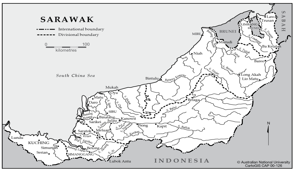
Figure 2. Map of Sarawak

whole of Peninsula Malaysia, 131,573 square kilometres (Furuoka, 2014). Sarawak was divided into twelve divisions which are Kuching, Sibu, Miri, Bintulu, Mukah, Sri Aman, Limbang, Sarikei, Kapit, Betong, Serian and Kota Samarahan. Presently, most of the major town and cities in Sarawak is connected through Trans-Borneo Highway. Approximately 30,000km of road in Sarawak was constructed by the State Government where the main road route is through Trans-Borneo Highway (Hakim et al., 2018). On the record, Sarawak has more than 40 ethnic groups with each of them own their distinct language, traditions, customs, culture and lifestyle (Colchester, Pang, Chuo, & Jalong, 2009). Based on the statistic reported by Department of Statistics Malaysia (2019), 2.806 million people in Sarawak were categorized into four ethnics i.e., Bumiputeras (Note 1) (75.5%), Chinese (23.7%), Indian (0.3%) and other (0.3%). The study was conducted in the Central Region of Sarawak i.e., Sarikei, Sibu, Selangau, Mukah, Oya, Dalat (in between Matu and Mukah), and Kanowit (refer Figure 2). Sarikei, Sibu, Selangau are the middle areas or middle routes connecting the Northern and Southern areas of Sarawak. The total population of the study areas is 484.9 thousand (Department of Statistic, 2020). The ethnic population in Central Region of Sarawak was predominantly of Malay, Iban, Melanau and Chinese (Ting & Rose, 2014).