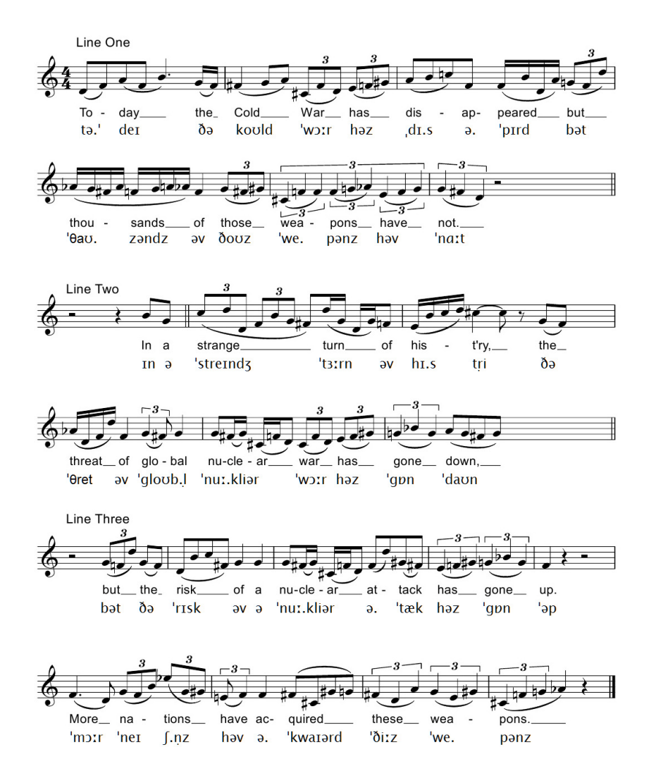
Figure 1. Excerpts from Obama's Prague speech, with text and IPA phonetic and musical notation transcriptions

In the final experiment, we converted the prosodic information in a section of Obama's speech and of the Comic Novel to musical notation (see fig.1 for an example) and asked 22 volunteers (6 males and 16 females, mean±SD age 44.8±12.1 years) to rate the tunes, played with a synthesizer, using a modified version of the Geneva Emotional Music Scale (GEM-9) (Zentner & Eerola, 2009). Volunteers were asked to rate two other songs. One song ("Annoying") was a compilation of tunes played with a flute, downloaded from You Tube, using as search keywords "annoying", "disturbing" and other negative terms. The last song played to volunteers was the Bird Catcher's aria from Mozart's Magic Flute opera. The volunteers were unaware of how each song had been composed, although several volunteers inevitably recognized Mozart's music. In this experiment, the hypothesis tested was that the music derived from Obama's speech would evoke emotional responses congruent with the semantic content. For the music evoked by the Comic Novel we expected emotional responses less congruent with the declared comic/joyful intent. The "annoying" and Mozart's music pieces were added to the comparison to improve assay sensitivity and we hypothesized that they would evoke negative and positive feelings respectively.