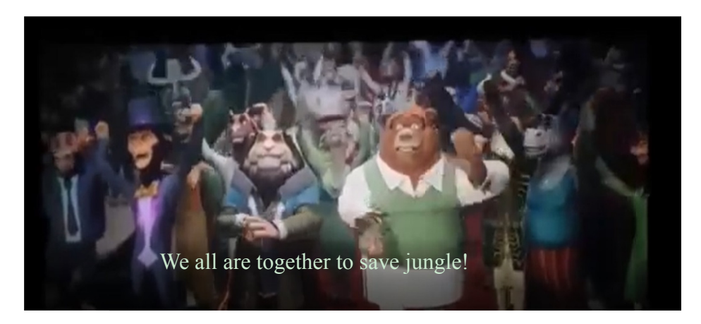
Figure 16. Lions, donkeys, monkeys and all animals are at one platform for the welfare of the jungle

This is the last scene of the movie when all animals get together to secure the jungle, their homeland. Simultaneously this scene also can be implemented to the real situation of our country. In reality, people of Pakistan are not concerned with the government of PPP or PMLN or PTI, the real thing is the justice, peace, prosperity, stability and progress in the country.