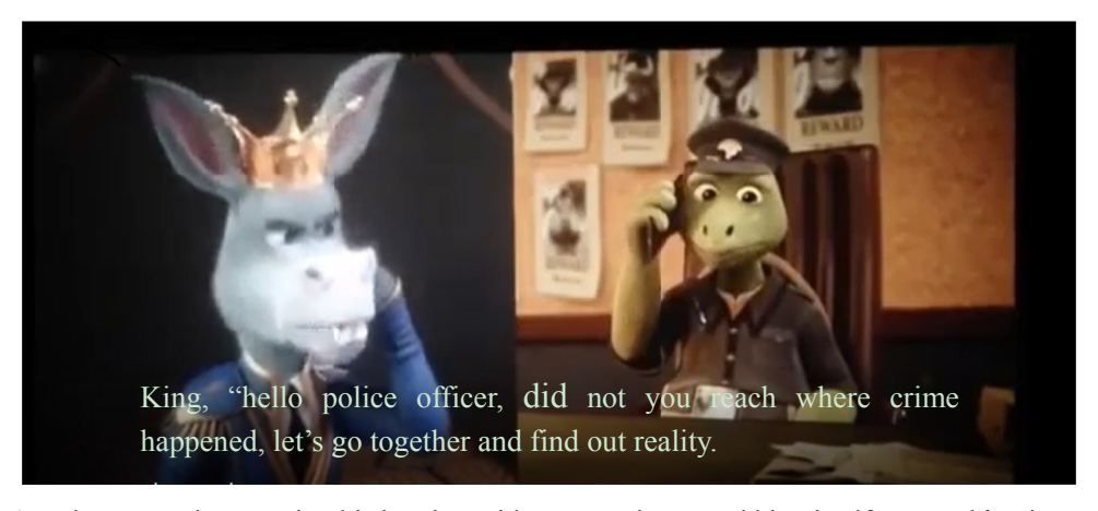
Figure 15. The most tolerant animal is hearing with great patience and king itself starts taking interest with public affairs

Animals are disappearing and no one can come to know that where those animals are going. There is an insecurity prevailing in the whole jungle. Animals stop coming out of their homes and avoid public meetings. Animals are kidnapped and are misused. They are being kidnapped for their skin, for circus and for animal testing and the clever animals are involved in their kidnapping otherwise if animals themselves would not involve, no external power would have been able to harm them. This situation also discloses the social reality prevailing in our society that until our own people or our own leaders would not have been involved in disappearing of people, no hidden power would be able to harm our people. If our own near and dear ones would not disclose the secrets no external power would have harm us.