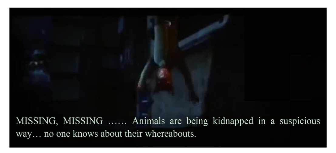
Figure 14. Animals are being kidnapped by unknown. The news broadcasted by news MNN, Monkey News Network

Animals are disappearing and no one can come to know that where those animals are going. There is an insecurity prevailing in the whole jungle. Animals stop coming out of their homes and avoid public meetings. Animals are kidnapped and are misused. They are being kidnapped for their skin, for circus and for animal testing and the clever animals are involved in their kidnapping otherwise if animals themselves would not involve, no external power would have been able to harm them. This situation also discloses the social reality prevailing in our society that until our own people or our own leaders would not have been involved in disappearing of people, no hidden power would be able to harm our people. If our own near and dear ones would not disclose the secrets no external power would have harm us.