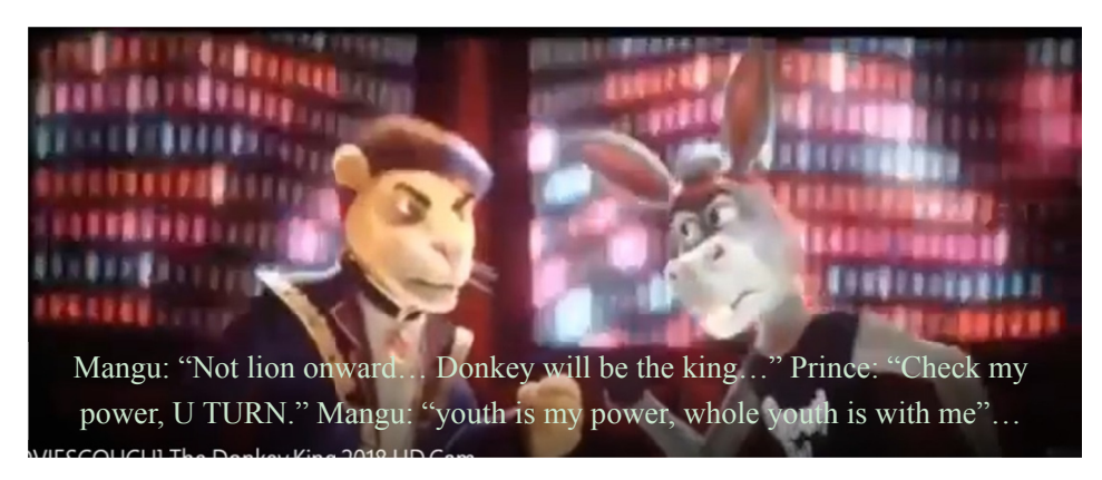
Figure 6. Battle between Prince and DK before elections

This situation occurs in the movie when king complains about his old age and arthritis and wants to take rest and put all the responsibilities and kingdom's matters on others or on its reliable ministers. But unfortunately, these helpers just make fun of their masters. This situation also reveals the reality that our leaders just take rest and have fun and just spend the leisure time with their friends and families and do not bother about their responsibilities. Another big reveal is that our leaders mostly suffer from fatal diseases. They keep on visiting abroad for their health checkups. This situation also criticizes the real situation when our politicians, our leaders go abroad for treatment. Foreign hospitals and doctors are for them and local doctors and hospitals are for the masses even these hospitals are in a pathetic situation that they are not for the leaders but for the masses. The clear discrimination has been shown by the medium of cinema in the society