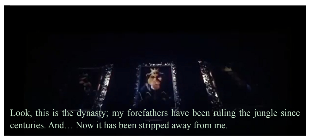
Figure 9. The dynasty system of Azad Nager

country like Pakistan should not wear such an expensive royal coat as our previous ministers have been putting on and have been enjoying the royal life in the prime minister house, which consumed a lot of budget of the country and which have been a great burden on the economy of this poor state. Our current government should have tried to get rid of these formalities which the previous governments have been practicing. After getting power PM announced that his government would not follow the previous trends of royal life and would spend a simple life to facilitate the poor country men. All the expensive things would be sold out and the money would be deposited to the national treasure as all these expensive things are the public asset not government itself. And people became happy after listening to such announcements.