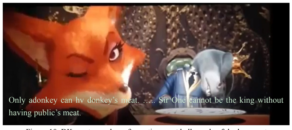
Figure 10. DK went senseless after eating meat balls made of donkey meat

This statement occurs when the king was forced to leave the palace and was making him scared by the closest minister that if he would not leave the palace people would have to throw him out of the palace. This situation reveals the reality of our society that when one does not remain in power, he has to leave the palace or prime minister house. This statement discloses the reality that in our country there has been a legacy system for many decades. As in the jungle, Lion has been the king forever, first time in the history of jungle this tradition breaks and one donkey becomes king. This situation also implemented and discloses reality of our society. First time it happens that a cricketer turns a politician and after a great and long struggle, he turns prime minister. As in the movie there are many elements and hidden powers which work to turn a donkey to king. Those hidden powers are the youth, establishment, media and the common masses. It is implemented on the real and current situation of our country that at the back of Imran Khan's victory there have many elements and powers been working forever. Without those powers he would never get success.