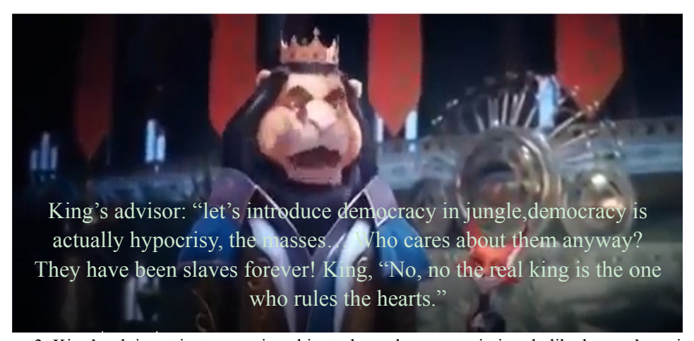
Figure 3. King's advisor tries to convince him to have democracy in jungle like human's societies

.This situation occurs in the movie, when before elections common masses are not happy from their current rulers. They protest against the government. The situation discloses the real situation of our society where the rulers usurp the rights of the masses and just use them for their own purposes. The statement "No more VIP culture" reveals the fact that actually no country man likes the VIP culture. The blockage of roads, the poor has to follow the law and no law for the rich; these distinctions are very much common in our societies which have been shown in the movie. The slogan raised by the participants of the rally "Eat green not goats" also symbolizes with the people who are slain by the rich for their own purposes. No more gangsters should charge the tax; another reality is being disclosed that everyone should work for their own. No one needs to usurp others rights they need to earn their own no matter how much powerful the gagsters are. Here cinema is trying to impact the viewer's perception of reality by using the words like 'BAKRI MARCH" and "EAT GREEN NOT GOATS" and by giving the message to the authorities that no more VIP culture would be acceptable.