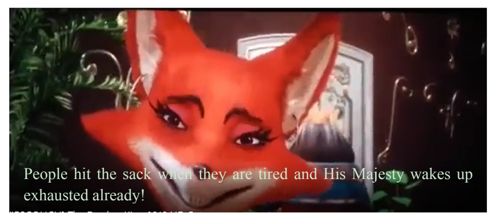
Figure 5. The king's advisor whispering at his back and making fun of him

This situation occurs in the movie when king complains about his old age and arthritis and wants to take rest and put all the responsibilities and kingdom's matters on others or on its reliable ministers. But unfortunately, these helpers just make fun of their masters. This situation also reveals the reality that our leaders just take rest and have fun and just spend the leisure time with their friends and families and do not bother about their responsibilities. Another big reveal is that our leaders mostly suffer from fatal diseases. They keep on visiting abroad for their health checkups. This situation also criticizes the real situation when our politicians, our leaders go abroad for treatment. Foreign hospitals and doctors are for them and local doctors and hospitals are for the masses even these hospitals are in a pathetic situation that they are not for the leaders but for the masses. The clear discrimination has been shown by the medium of cinema in the society