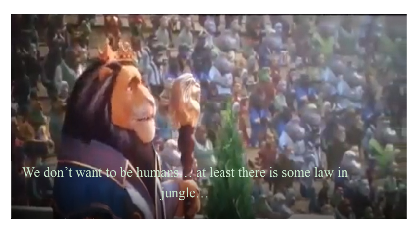
Figure 4. Light on king's views about humans

Another fact is being revealed with the statement of king's advisor that there is only so-called democracy actually everything is pre decided. When media person asks the king's advisor that what you will do to make Mangu wins. Will you do corruption or change the ballet boxes; it denies and says "No, I will change the minds of the people. We will play right and show left; we will aggravate the feelings of people against Lion king and will present Mangu the innocent and the only savior of the common people", she runs the campaign through media. It has been presented through this animation that DK can never be the king without the help of judiciary, establishment and ISI. Democracy is the rule of the humans they also choose their king through democracy actually through hypocrisy. This statement is mocking on all the human societies not only on our society. Cinema becomes successful to manipulate the viewer's perception of reality about democracy and what actually the planners and the rulers think about the masses.