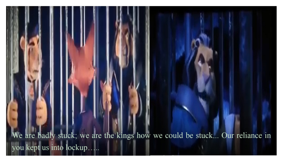
Figure 11. Lion King and its son is in prison as it indicates the real situation

It shows that media is the reflection of our society and can also be used to spread social realities. One bitter reality is also revealed through this statement that only the foolish leaders can blindly trust their advisors. Donkey is considered as the most foolish animal and the obedient one. It always obeys its master blindly. There is a silent message that the leaders and the public need to open their eyes and should not be fooled by others like the donkey.