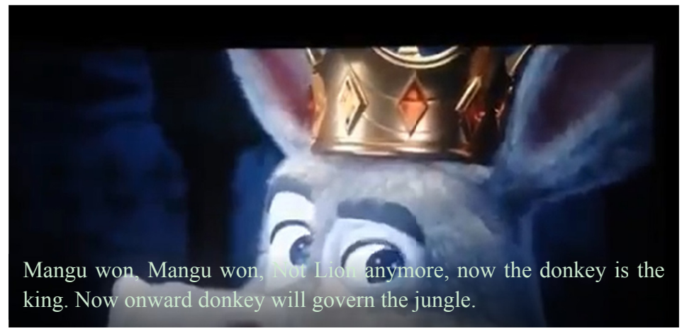
Figure 7. The system breaks first time in the history that a person who does not belong to royal family becomes a king

This situation happens when first time in the history of jungle, the dynasty breaks and a donkey becomes a king. People started to say that now the change has come." Tabdeeliaaagihy" now everything will change. It was predicted by the senior animals and their leaders that now the king is from us. It is one of them so it can better understand our problems and will secure us from the dangers. Another prediction is that as it is a grass eater so no animal should feel harm from hit as the previous kings were the meat eaters and every animal was scared of them. As it is not from the royal family so it would not spend a royal life and for sure will work for the welfare of the jungle. It would be the real savior of the jungle. All the described prediction could be implemented on the current situation of our country and reveals the reality in our society.