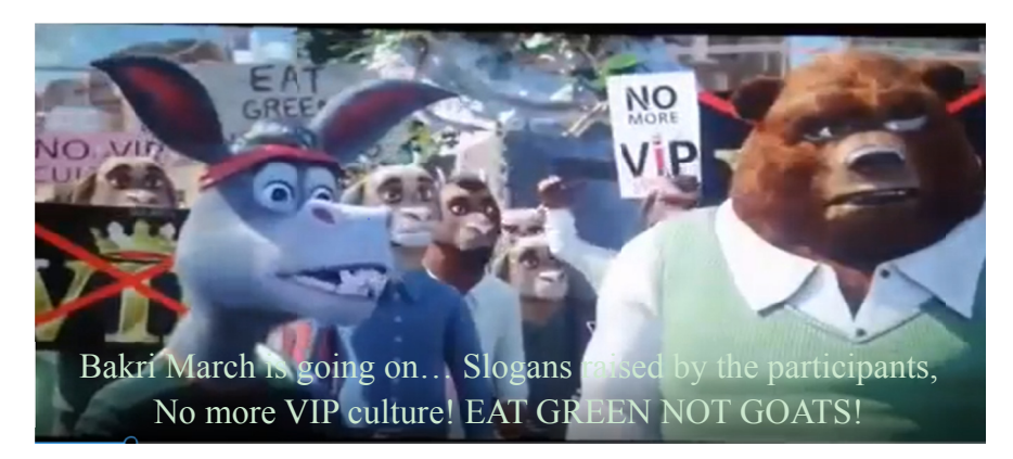
Figure 2. The protest of vulnerable animals against the king of the jungle

.This situation occurs in the movie, when before elections common masses are not happy from their current rulers. They protest against the government. The situation discloses the real situation of our society where the rulers usurp the rights of the masses and just use them for their own purposes. The statement "No more VIP culture" reveals the fact that actually no country man likes the VIP culture. The blockage of roads, the poor has to follow the law and no law for the rich; these distinctions are very much common in our societies which have been shown in the movie. The slogan raised by the participants of the rally "Eat green not goats" also symbolizes with the people who are slain by the rich for their own purposes. No more gangsters should charge the tax; another reality is being disclosed that everyone should work for their own. No one needs to usurp others rights they need to earn their own no matter how much powerful the gagsters are. Here cinema is trying to impact the viewer's perception of reality by using the words like 'BAKRI MARCH" and "EAT GREEN NOT GOATS" and by giving the message to the authorities that no more VIP culture would be acceptable.