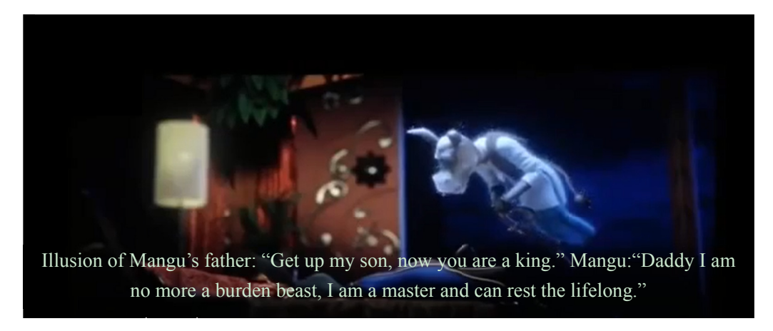
Figure 12. King's laziness and its father's effort to awake its conscience to work for the nation

This situation and discussion occur when Mangu, the donkey becomes a king of the jungle and forgets its promises with the people and just enjoys the luxuries of the king's life. Its father who is not alive now mostly appears to wake its son up in the form of illusion. The statement of Mangu's father is sarcastically convincing its son to fulfill its responsibilities as a king. It actually criticizes and mocking the reality in our society that kings and the rulers should focus on their responsibilities and should take care of the masses which is their actual duty. The king's reply also reveals the reality of our political system and it is a bitter sarcasm on the life of our ministers. When it claims that I am not a burden beast any more, now I can rest forever because I am a king. This is what our leaders think and behave after getting power they forget every promise made by them with the common people.