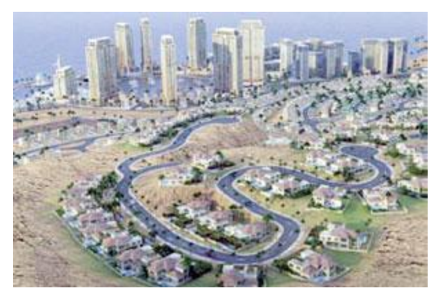
Figure 2. Marsa Zayed project

As a result of the investment climate improvement policies at (ASEZ) to attract the Arabic investment, Aqaba economic region attracted many of the Arabic investments, and Marsa Zayed project was a model of these investments.