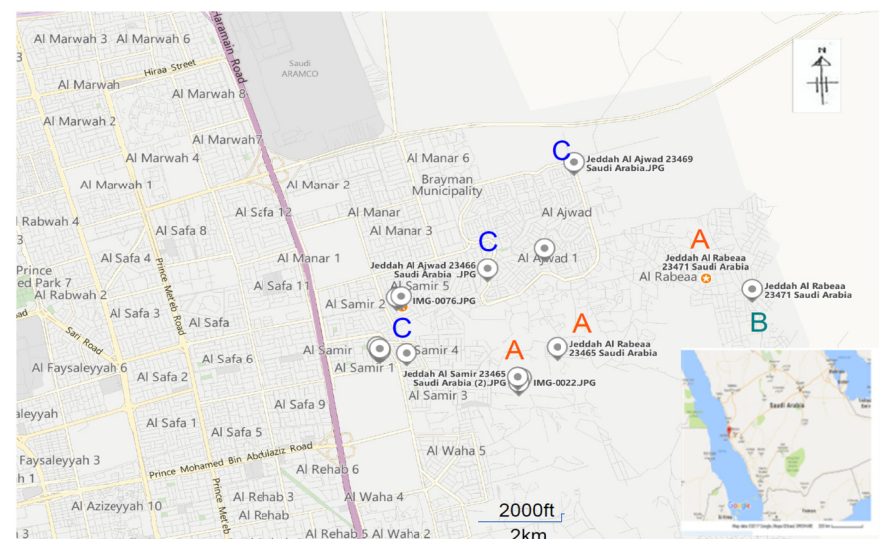
Figure 1. Location of soil samples at the Polluted area (A), Southeast polluted area (B), and Northwest polluted area (C).

Jeddah has expanded in the last three decades, and the expansion continues at an unpredictable rate. New districts have continued to grow and accommodate the increasing population. Growth is also occurring in the countryside of Jeddah. One of the largest sources of pollution in the city of Jeddah is the presence of Sewage Lake (established since 1992), which extends over an expanse of 2.6 km<sup>2</sup>. It became the central sewage downstream, with the passage of time, the stretch of residential areas, the lake poses a danger to the neighborhoods adjacent to the lake, as it became filled with toxic elements, which affecting the soil, air, and water. The movement of these elements became easier with rising water to approximately 19 million m<sup>3</sup>. One of these new residential areas is located nearby the Sewage Lake. It is a one of the largest sources of pollution, located east of the city, east of the highway along the way Hada al-Sham extended to the Makah. Over 17 km away from the study area (districts: Al Samer 1, 2, 3, 4, and 5, and Al -Ajwad in the northwest of the lake and the National Park area in the southeast of the lake. The lake presents a substantial risk to the area surroundings and the population (Jeddah Municipality, 2010).