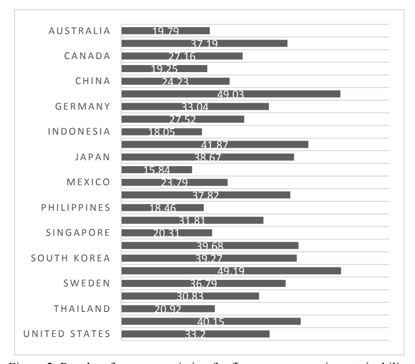
Figure 2. Results of country variation for firm engagement in sustainability

An initial analysis was performed to determine whether there was variation in average levels of company engagement in sustainability, depending on the location of the firm. Results of a one-way ANOVA investigation, illustrated in Figure 2, showed that there were significant differences in firm sustainability when companies were compared by country (F (24, 375) = 5.809, p < .000). On average, companies that tended to have the highest firm sustainability were located in developed economies of several European countries and companies that tended to have the lowest firm sustainability were located in developing economies of several countries in Asia and South America. French firms (M = 49.03) had the highest average level of company engagement in sustainability, which was approximately 210% greater than Malaysian firms (M = 15.84), which had the lowest average levels of company engagement in sustainability. Tukey and Games-Howell post-hoc comparisons of the twenty five groups indicated significant differences in firm sustainability between many of the countries. The greatest number of significant pair comparisons were between companies in France and companies in twelve other countries.