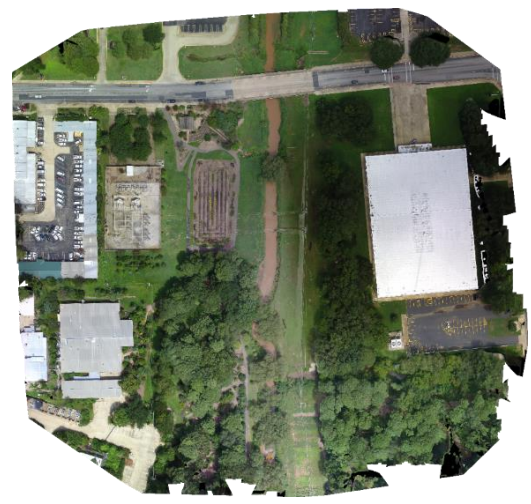
Figure 1. Drone derived orthophotomosaic of Jim and Beth Kingham Children's Garden

To assess the accuracy on height measurement, a total of 30 buildings were selected. Each was identified in LP360 and ArcScene for height measurement. In addition, the same buildings were identified and measured in Pictometry, which has been proved with satisfactory accuracy in measuring height. Finally, each building was measured in situ using a height measuring rod to obtain actual height. By calculating the root mean square error (RMSE) for each remote measurement approach, the accuracy was assessed and compared between the three, LP360, ArcScene, and Pictometry. Furthermore, an analysis of variance (ANOVA) was conducted to determine if there is significant difference on the mean absolute error among the three height measurement methods.