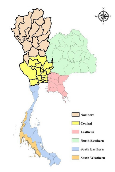
Figure 1. Study area; Northern and Central parts of Thailand

Thailand's Northern region is dominated by mountainous terrain. On the other hand, the Central region is the lowland of the Central Plain drained by the Chao Phraya River. Thailand's area is approximately 513,120 sq. km., the different terrain does have impacts on regional climate as well.