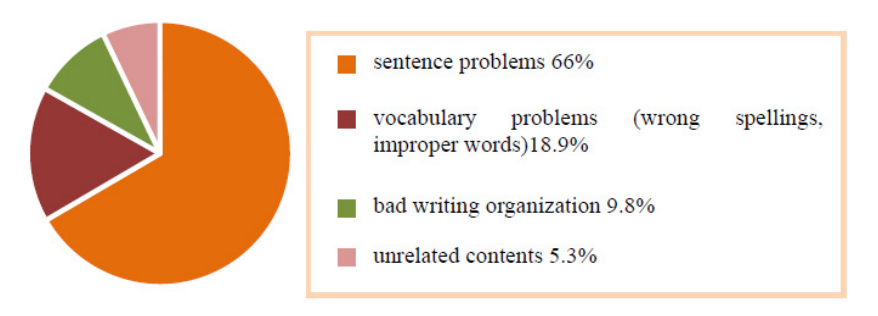
Figure 1. The distribution rate of writing problems