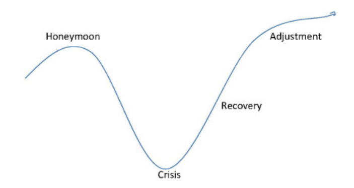
Figure 1. Lysgaard's (1955) U-shaped curve

adjustment in the host culture, in which the sojourner can adequately function in the new culture (Chen, 2013).