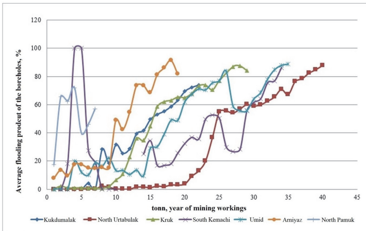
Figure 1. Dynamics of the average water-cut of wells from the development period

Analysis of the dynamics of the average water cut of wells constructed depending on the development period (Figure. 1), the depletion of recoverable reserves (Figure. 2) and the current oil recovery factor (Figure. 3) show that they differ significantly among themselves in the analyzed objects. In this regard, consider