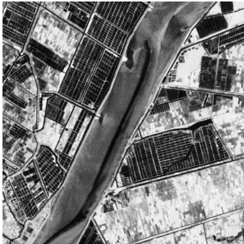
(e) Fusion image using PCA transform (f) Fusion image using the proposed method Figure 3. Experimental results by different fusion methods