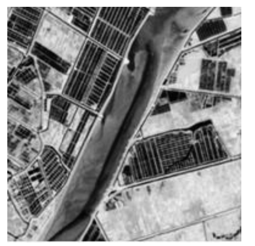
(a) Original ETM+743 bands image