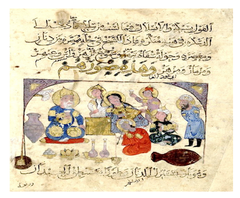
Figure 3. Maqama 12, the French National Library, Version 3929, No. 34 v