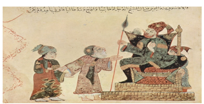
Figure 1. Hariri's Maqamat, in 1237 AD, Maqama 10, the French National Library, Version 5847, No. a6

considerable attention to states of faces and there are many differences between this painting and paintings used for other versions. The governor's lusty glances to the boy are apparent in the picture. He tries to hide his desire to the boy by moving the left hand and the spear put in front of his face. On the other hand, Abu Zaid's fraud and deceit is clearly observed through the painting with upward angle of spear, his evil eyes and white-bearded show. However, he has hidden these features behind his false wisdom words. The painter illustrates a teenager behind the governor's ruling seat who is looking at his new rival (and in fact is another victim of the homosexual governor). But the newcomer boy has been depicted with a feminine face, long lashes and hooded eyes. He has been represented with such a plump face and decorated with fresh clothing that guarantees the governor's sexual interest to him.