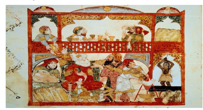
Figure 2. Hariri's Maqamat, 1237 AD, Maqama 12, the French National Library, Version 5847, No. 33a