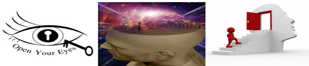
Figure 1. The pictures of self architect and the mind observer eye

The above cycle causes the student to understand the language of self friendship and this process leads to the formation of companionship and conversation with the self architect himself so he learns that to release the innovation from the inside he should be aware of ingenuity and create thirst in him and for releasing the new innovation he close his mouth and ride on his thought and take the others away from his thoughts in order to record the new vents of theoretical and represent them.