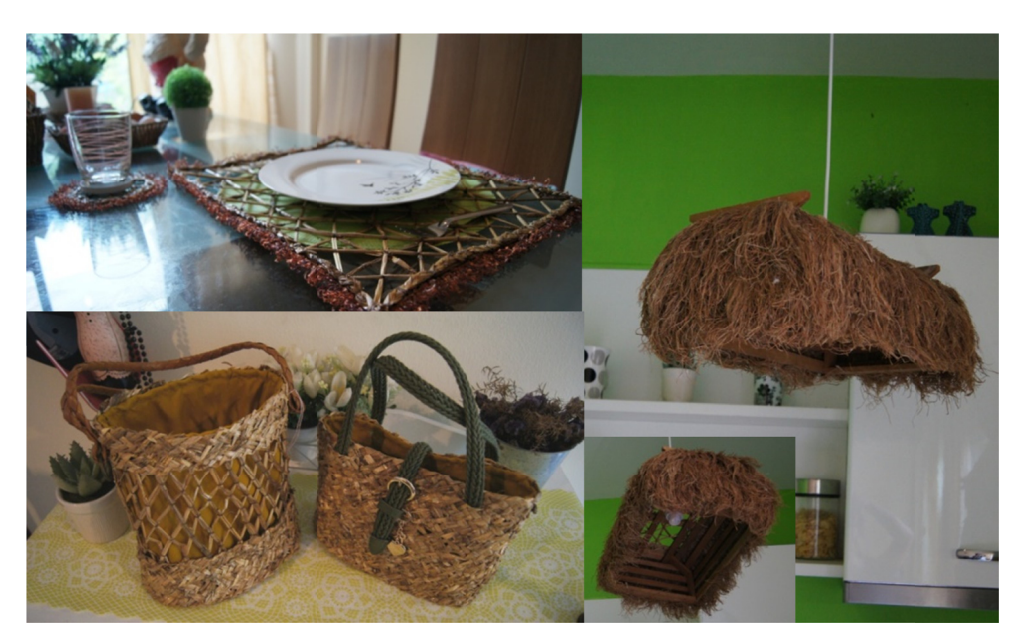
Figure 3. Samples of environmentally friendly product designs from rice stumps for community economy Table 4. Average values of scores and comparisons between manufacturers and designers