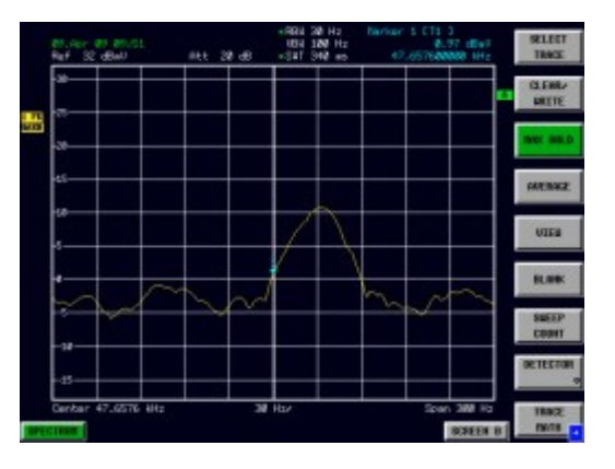
Figure 1. Spectrogram of electric steel sample microwave (MW) sensor with frequency of 37GHz (under tension)