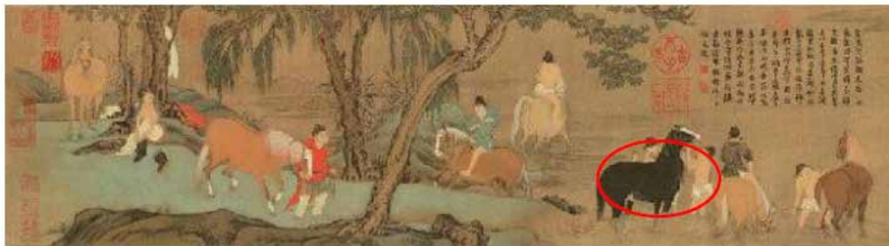
Details of Zhao's Bathing Horses