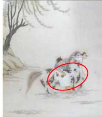
Gu Embroidery: Bathing Horse