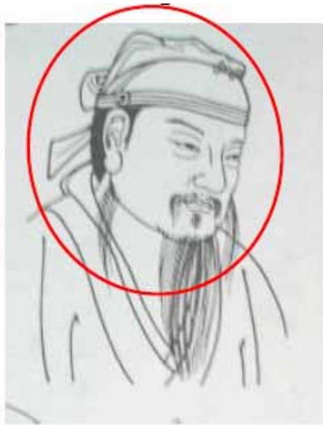
Yuan dynasty mural in Yongle Palace