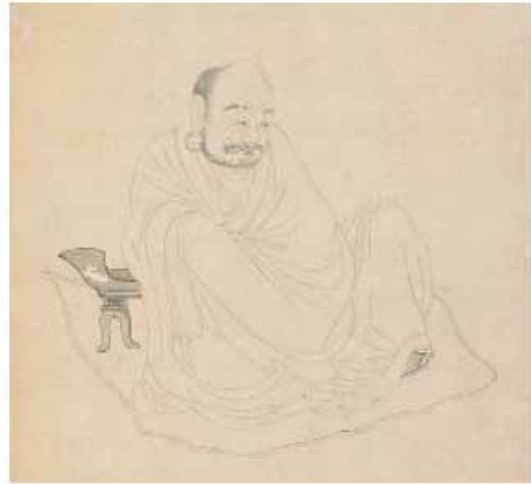
An Arhat painted by Ding Yumpeng