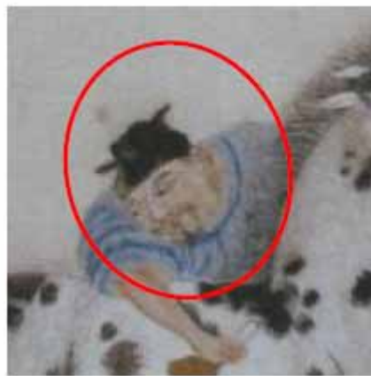
Details of Han's Bathing Horse