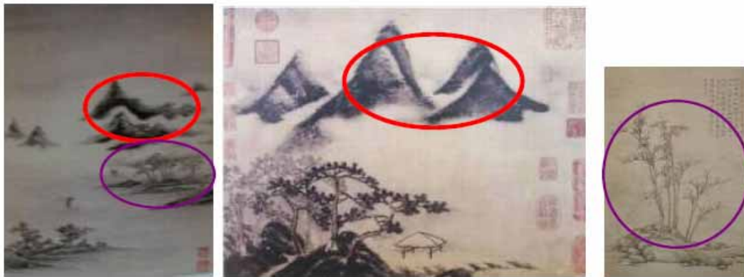
Gu Embroidery of Mi Fu's Landscape