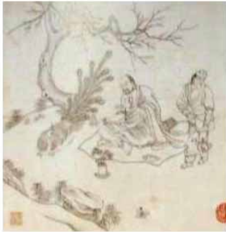
Gu Embroidery of 16 Arhats