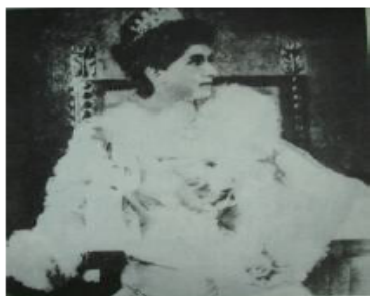
Portrait of the Italian Queen