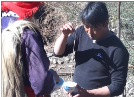
Figure 7. Laying the ring and necklace