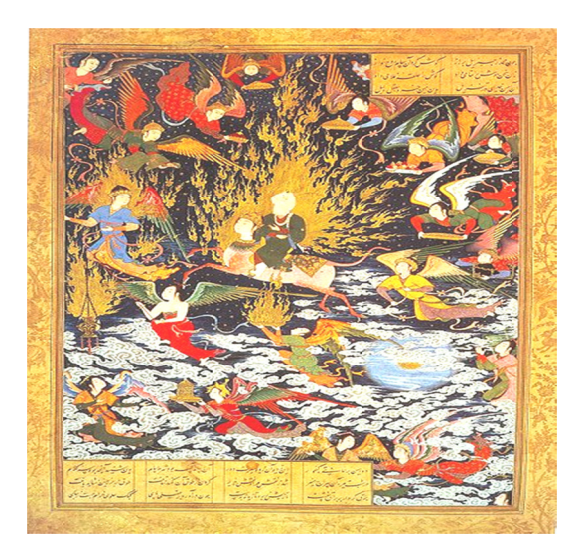
Figure 2. Nezami's Khamse, Tabriz's School, painted by Soltan Mohammad, British Museum