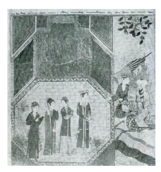
Figure 1. Ascension, Herat's School, the National Library of Paris