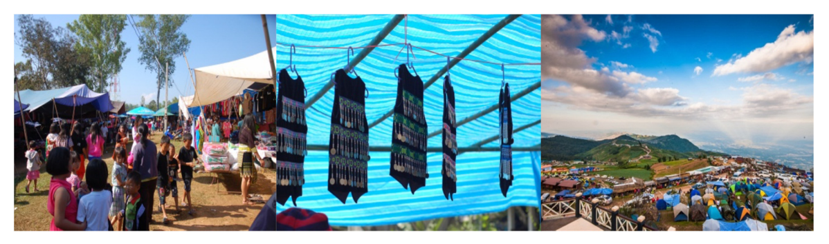
Figure 4. The rapid growth of tourism industry in Khao Kho District, Petchabun Province

For the religious and ideological factors, in the past, Hmong ethnic group living in Khao Kho District, Phetchabun Province believed in superstitions and predecessors. Later, Christianity became more popular in the area and, then, followed by the predominance of Buddhism. As a result, there have been the diversity of beliefs in Khao Kho community. The appearance of architecture that symbolizes different religions is situated in Khao Kho area such as spirit houses, Christian churches, and Buddhism temples. Changes in religion and ideology directly influence people's belief at a great extent, so the social and cultural changes would concomitantly occur in a community.