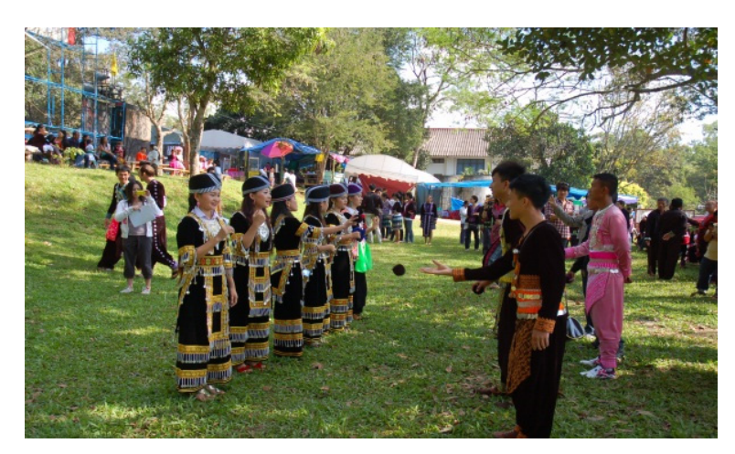
Figure 5. 'Yone Look Chuang' ceremony performed by male and female teenagers